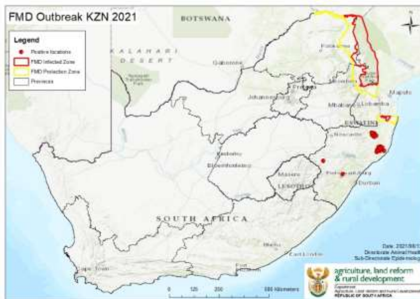
Map 1: FMD positive locations in KwaZulu-Natal, South Africa

There has been no significant change in the status of the Foot and Mouth Disease (FMD) outbreak in KwaZulu-Natal Province since the previous report of 10 September 2021. Serological and clinical surveillance is continuing. The total number of affected locations remain at twenty-nine (29), comprising twenty-seven (27) diptanks and two (2) feedlots. Movement control measures remain in place in the reduced Disease Management Area, since the disease is still present within this area.