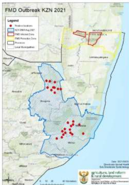
Map 2 & 3: Revised DMA with the two clusters of affected dip tanks in Nongoma and Mtubatuba

Movement restrictions remain in place on cloven-hoofed animals, their products and genetic material out of, into, within or through the revised DMA, except on authority of a permit issued by the Veterinary Services of the area. Applications to move animals out of, into, within and through the DMA are evaluated with regards to risk on a case-by-case basis. Permits are granted for movement and slaughter of animals from locations that practice adequate biosecurity to ensure that there is a low risk for spreading the disease. Roadblocks and Visible Veterinary Patrols monitor any movements of animals in the DMA, to confirm that such movements have valid permits issued by the movement control officials of the province, with fines issued to persons moving cloven-hoofed livestock without the necessary permission.